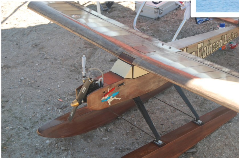
NOSE ART ON MARK'S TELEMASTER AND A NICE LOW PASS