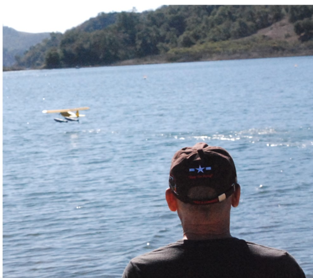
CUB GETS AIRBORNE