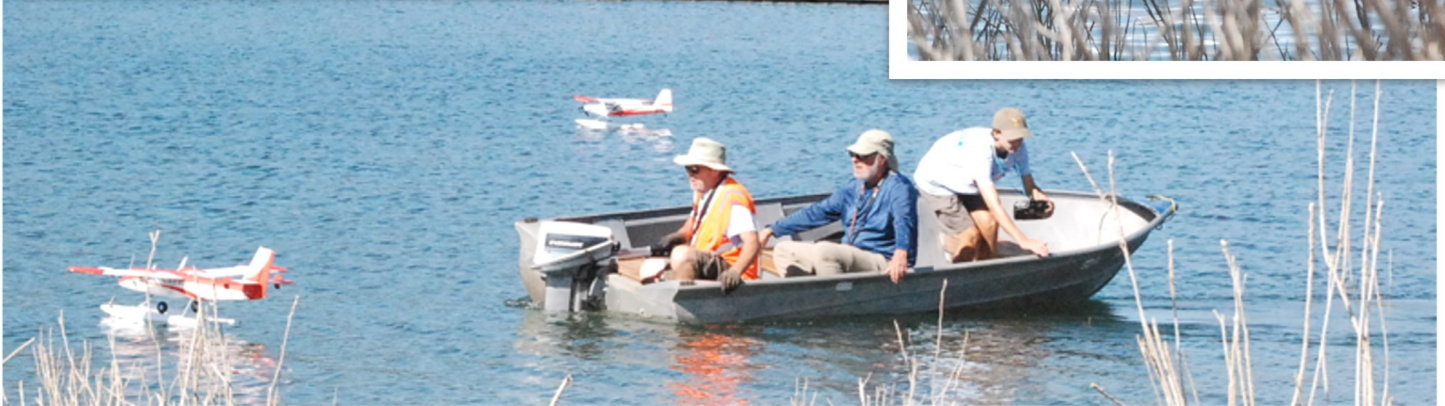
THE RECOVERY CREW WAS BUSY, BUT EFFICIENT