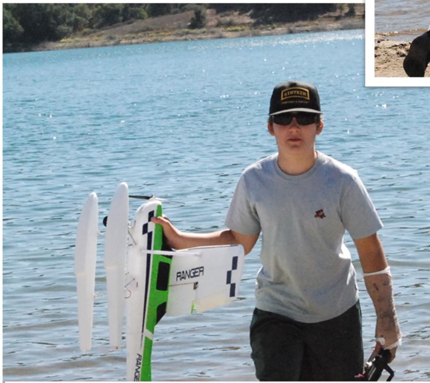
THIS YOUNG FELLER MADE A PERFECT LANDING, MOM AND DAD WERE IMPRESSED!