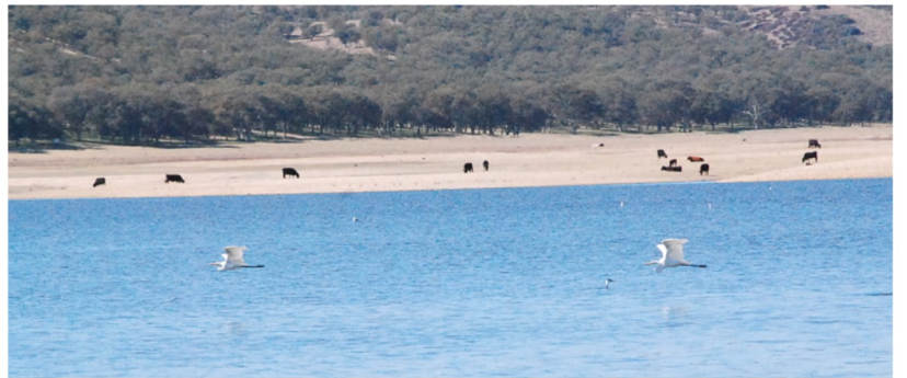
TWO-SHIP FORMATION OF HERONS: