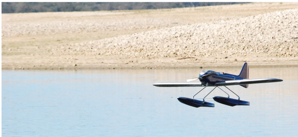
RICH'S SUPERMARINE SCHNEIDER CUP RACER; SCRATCH BUILT FROM PLANS SCALED UP FROM A SMALLER VERSION