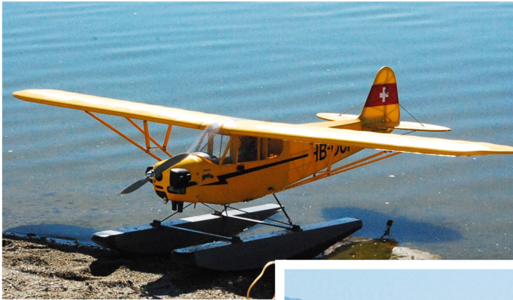
GARY'S SWISS CUB; VERY PRETTY FLIER