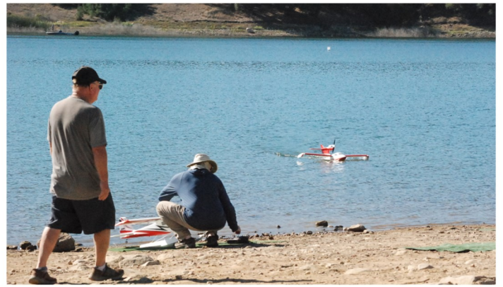
THE FLIGHT LINE