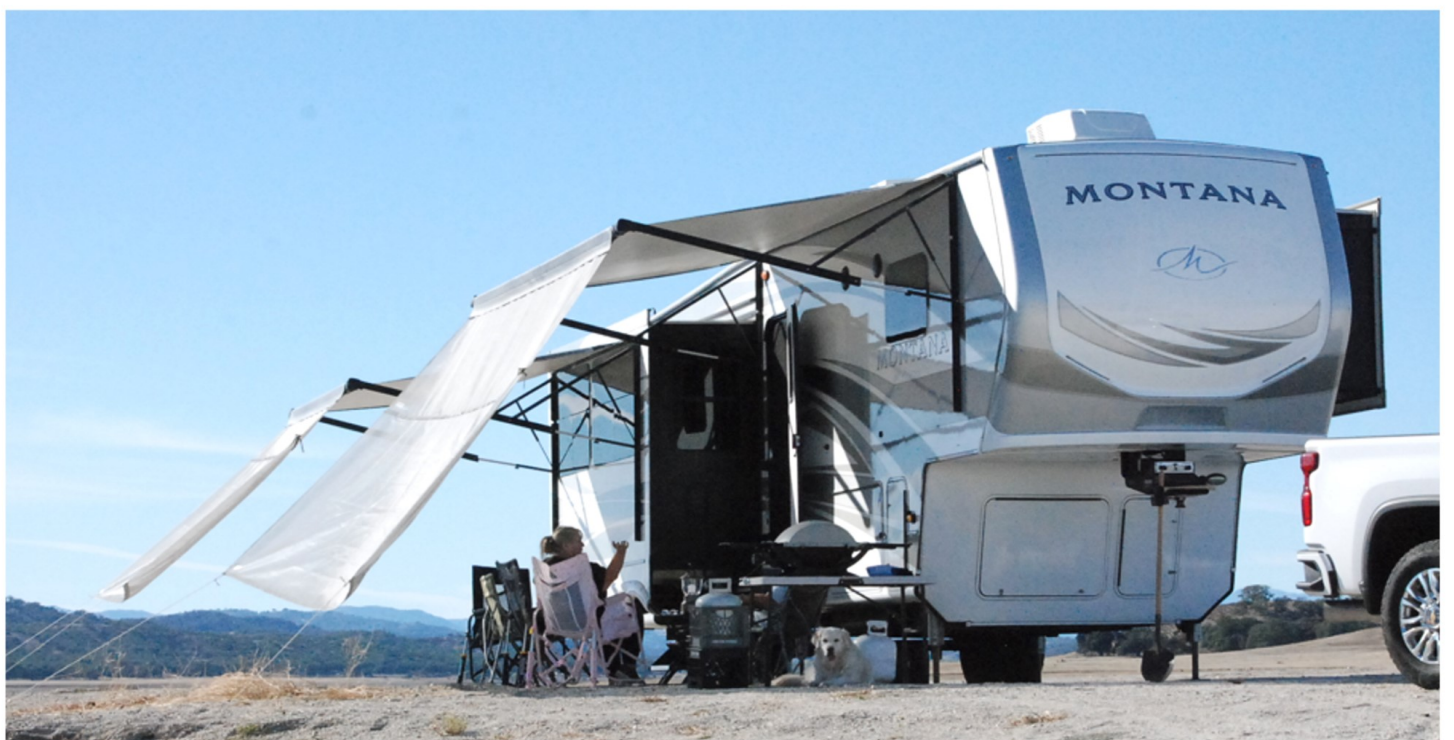
LA CASA DE SINGLETON, THE PLACE TO HANG OUT; DAISY THE DOG KNOWS THAT IT'S WHERE TO BE