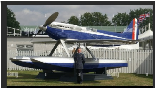
1931 SCHNEIDER CUP RACER