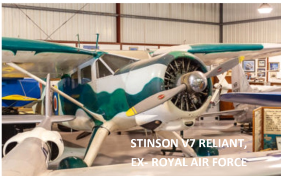
STINSON V7 RELIANT, EX. ROYAL AIR FORCE