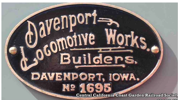
BUILDER'S PLAQUE ON THE 1918 DAVENPORT 2-6-2 TRENCH LOCOMOTIVE

Last week, there were a number of steam railroaders from Wales, UK, doing a working tour of steam railroads in California. They were hard at work running the trains all day, from polishing brightwork and paint to driving the engines around the layout. Bunch of nice folks. Definitely looking forward to their next event!