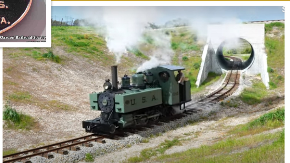
THE 1918 DAVENPORT ENGINE AND THE SHORTER OF TWO TUNNELS